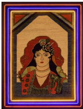
Lot 57- Parviz Tanavoli, "Farangi Woman on Persian Carpet II" Bijar Weave and LED Neons, 144×112×10cm

The online auction starts on Tuesday, December 12 at 6:00pm and continues through Friday, December 15 at 6:00pm when the final bids are announced. The artworks can be viewed at https://tehranauction.com/e-catalogue/1402-azar/ . Some of the highlights are as follows: