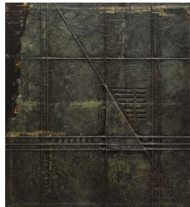
Lot 55 – Masoud Arabshahi, "Untitled" mixed media on canvas, 126×118 cm